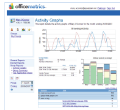
Simple, Graphical, Web based reports.